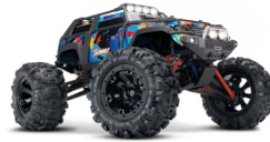
1/16 Summit, 720XX