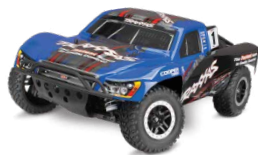
Slash 4X4, 680XX