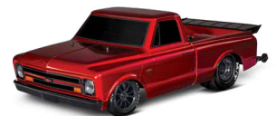
Drag Slash, 94076-4