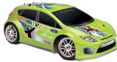
1/16 Fiesta, 73XX