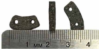
Traxxas slipper pads with size reference

Slipper pads are composite material pads that measure 14x6x2.5mm and weigh approximately 1 gram per set of 3. Nitro model brake pads are similar. The friction pads are non-friable (i.e., do not easily crumble, break apart, or release dust or fibers), generate minimal dust from wear, and for all electric models are enclosed within a cover on the transmission assembly. See below for examples.