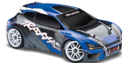
1/16 Rally, 73XX