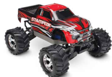
Stampede 4X4, 670XX