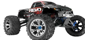
Revo, 590XX and 5310