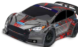
Ford Fiesta ST Rally, 74054 and 74064