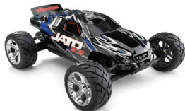
Jato, 550XX and 5510