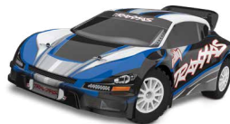
Rally VXL, 7407X